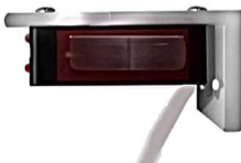
Sensor can be installed looking to the side.