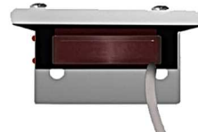
Sensor can be installed looking to the front.