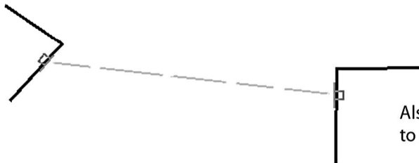
Also, Flush mount brackets can be supplied to cater for angled positioning of the sensors